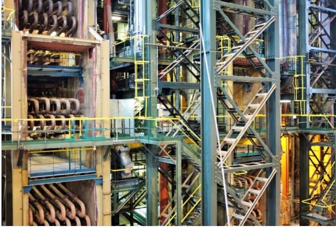
Figure 5. Phénix Steam Generator Section