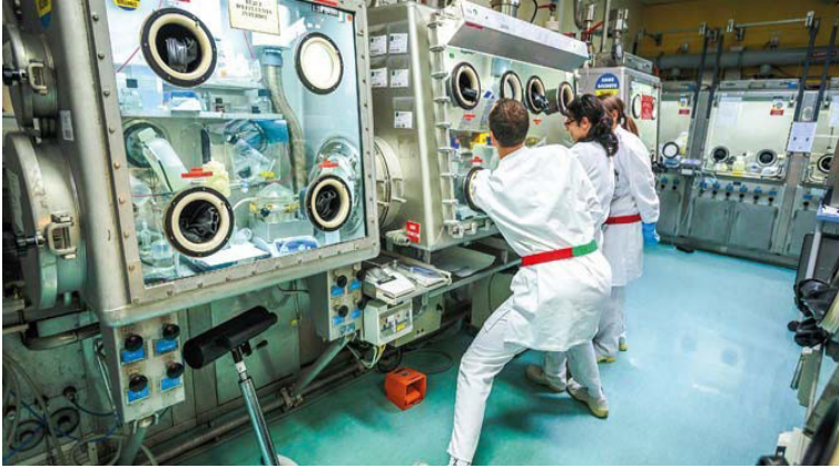
Figure 3. Glove Boxes