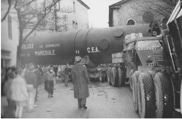
Figure 2. “The Nuclear Centipede”