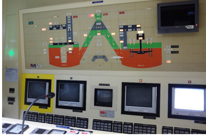
Figure 6. Phénix Control Room