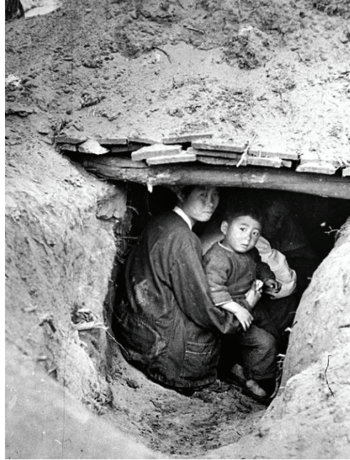
Figure 2. Family in a Dugout Shelter