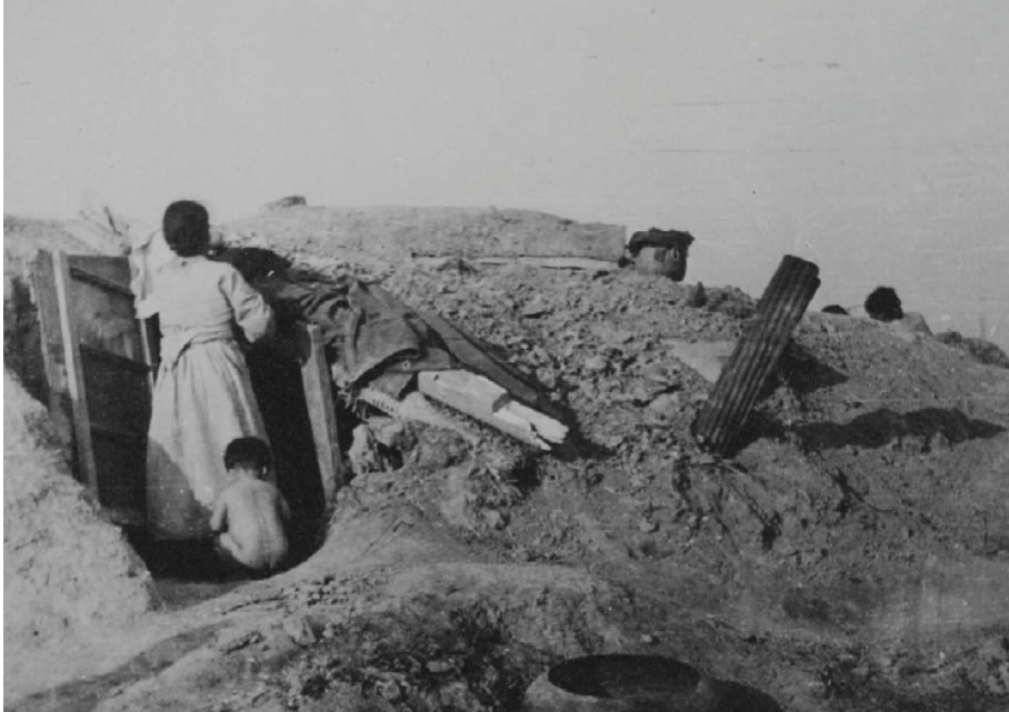
Figure 1. Woman and Child in the Entrance of a Mud-hut