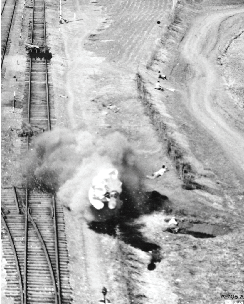
Figure 4. Railroad Interdiction by USAF showing North Korean Laborers, 1951.